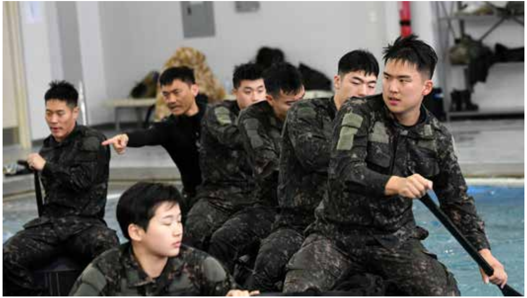
Cadets from the Korean Military Academy receive instruction during water survival training hosted by the 2nd Infantry Division on Camp Humphreys, South Korea, Feb. 21-24. The Cadets received training in an effort to prepare them for the Sandhurst Military Competition held at the United States Military Academy, at West Point, New York, in April 2023.