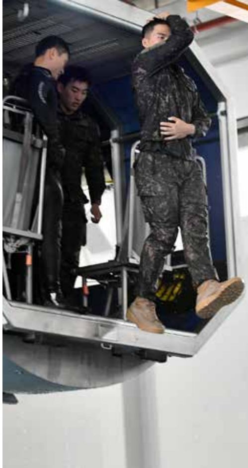
대한민국 육군 사관학교의 생도들이 캠프 험프리스의 제2 보병사단이 주최한 수중 생존 훈련의 교육을 받고 있다. 사관생도들은 2023년 4월 미국 뉴욕의 웨스트포인트 육군사관학교에서 열리게 될 샌드허스트 군사 대회를 준비하고자 훈련을 받고 있다.