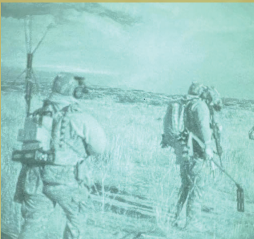
Army Explosive Ordnance Disposal technicians from the Fort Bliss, Texas-based 734th Ordnance Company (EOD) integrated with Fort Bragg, North Carolina-based 3rd Special Forces Group (Airborne) Soldiers during Exercise Sage Eagle at White Sands Missile Range, New Mexico, Jan. 24 – 31, 2022. The 734th EOD Company is part of the 3rd EOD Battalion, 71st EOD Group and 20th Chemical, Biological, Radiological, Nuclear, Explosives (CBRNE) Command.

importance is substantial as it provides the detachment an additional capability to conduct operations without degrading the detachment's organic personnel."