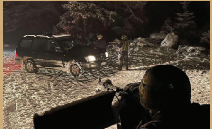
Combined Special Forces Operational Detachment-Alpha and Serbian force conduct vehicle interdiction against a Blue Force.

Previous efforts to engage U.S. SOF as an opposition forces element at JMRC had faltered. At first glance, the benefits, from a Blue SOF perspective, appeared to be stacked. Given the choice between operating, on one side or the other, the intuitive answer was to prioritize Blue SOF functions. But closer inspection has dispelled that myth. Operating on the Red SOF side provides all the Blue SOF