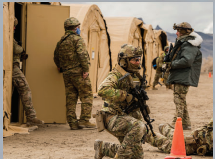
A Deployed Aircraft Ground Response Element Airman assigned to the 27th Special Operations Mission Support Team provides security during a 27th Special Operations Wing operational readiness exercise at Dugway Proving Grounds, Utah, March 22, 2021. The Mission Support Team concept provides a way forward in building small, scattered teams capable of operating independent of main operating bases.

“The MAC helps the Air Force and [U.S. Special Operations Command] create cost-effective and complex dilemmas for our adversaries, particularly with runway independence for the Joint Force and our allies,” said