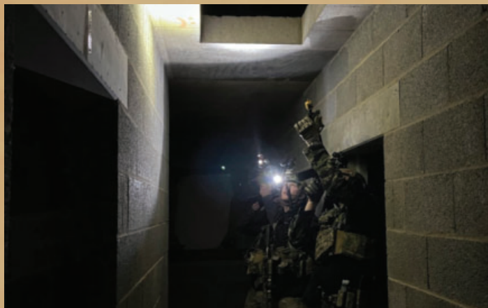
American and Serbian Special Operations Forces conduct a raid against Blue Force American SOF element.

The significant reduction in military operations worldwide has increased the demand for training opportunities. Expanding the SOF footprint also at other joint national training capability venues, to include Red as well as Blue SOF operations, would enlarge and enhance training for SOF, and it would increase the overall opportunities for SOF/CF I3 training. In-line with current efforts at the Special Operations Training – Detachment at JRTC, we can also credit the JMRC SOF Cell for operationalizing this concept and for developing an additional template for future SOF training at other JNTC venues.