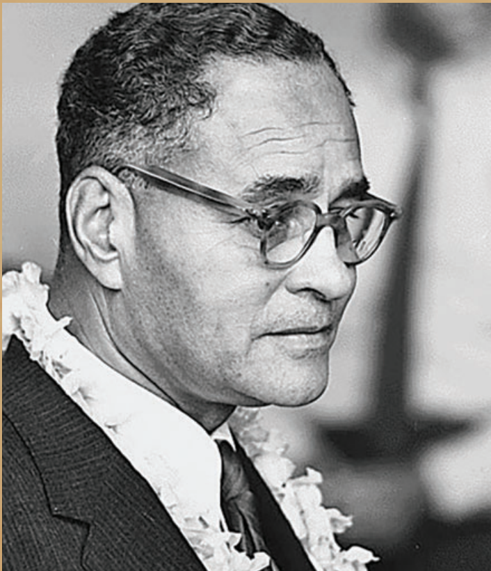
Ralph J. Bunche in 1963 while working with the United Nations.

While the Office of Strategic Services (OSS) played a key role in helping the allies win World War II, some of its members went on to become peacemakers in the post-war period. Ralph Johnson Bunche, a political scientist recruited by the OSS in 1941 because of his knowledge of colonial Africa, was one such person. And yet, history remembers him mostly as one of America's most prolific negotiators, accomplished scholars, and lifelong champion of civil rights for people worldwide, and not as much an intelligence