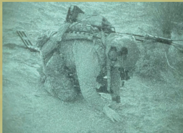
An Army Explosive Ordnance Disposal technician from the Fort Bliss, Texas-based 734th Ordnance Company (EOD) integrated with Fort Bragg, North Carolina-based 3rd Special Forces Group (Airborne) Soldiers during Exercise Sage Eagle at White Sands Missile Range, New Mexico, Jan. 24 – 31, 2022.