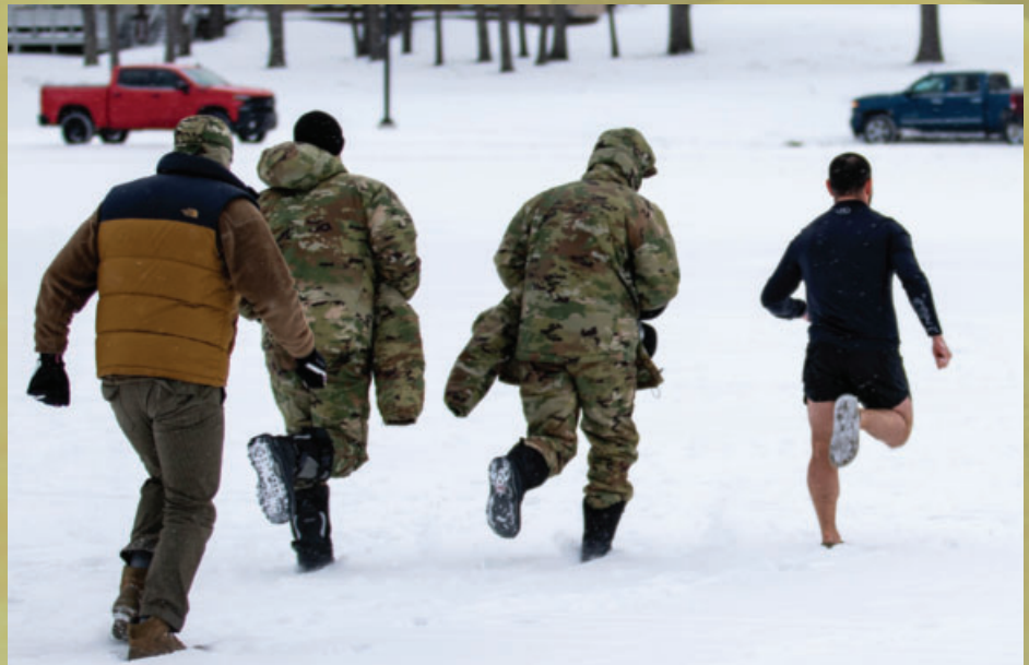
Special Operations Forces from the U.S. Army’s 20th Special Forces Group (Airborne) Massachusetts Army National Guard teamed up Jan. 24, 2022, with local first responders from Muskegon, Roscommon, Crawford and Grand Traverse counties to perform intensive hypothermia training at Lake Margrethe near Camp Grayling, Mich. The event took place during Northern Strike 22-1 (“Winter Strike”), a National Guard Bureau-sponsored exercise held Jan. 21-30 with participants from several U.S. states and partner forces at Camp Grayling Joint Maneuver Training Center and Alpena Combat Readiness Training Center, Michigan, which together comprise the National All-Domain Warfighting Center.