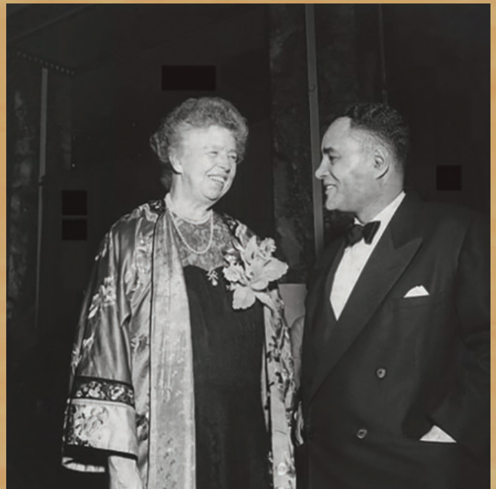
On May 9, 1949, former First Lady Eleanor Roosevelt hosted a dinner party in Ralph Bunche's honor. Bunche and the First Lady helped with establishing the Universal Declaration of Human Rights in 1948.

Bunche played an integral role in the creation of the United Nations and contributed greatly by helping to write its organizational charter. In 1950, his work on a peace treaty between Arab nations and Israel earned him the distinction of becoming the first American person of African descent to be awarded the Nobel Peace Prize. In 1968, he was appointed Under-Secretary-General of the United Nations for Special Political Affairs. Acknowledging his many achievements in peace making and human rights, a park across the street from the United Nations building in New York City was named