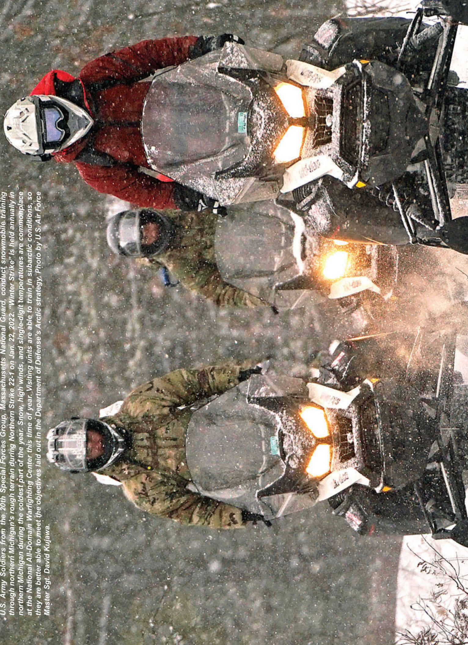
U.S. Army Soldiers from the 20th Special Forces Group, Massachusetts National Guard, conduct snowmobile training through northern Michigan's rough terrain during Northern Strike 22-1 on Jan. 22, 2022. "Winter Strike" is held annually in northern Michigan during the coldest part of the year. Snow, high winds, and single-digit temperatures are commonplace at the National All-Domain Warfighting Center this time of year. Visiting units are able to train in subarctic conditions, so they are better able to meet the objectives laid out in the Department of Defense's Arctic strategy.