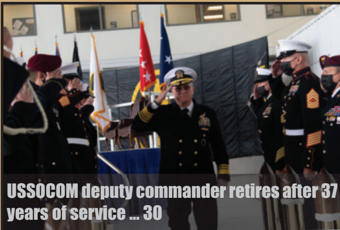
USSOCOM deputy commander retires after 37 years of service ... 30