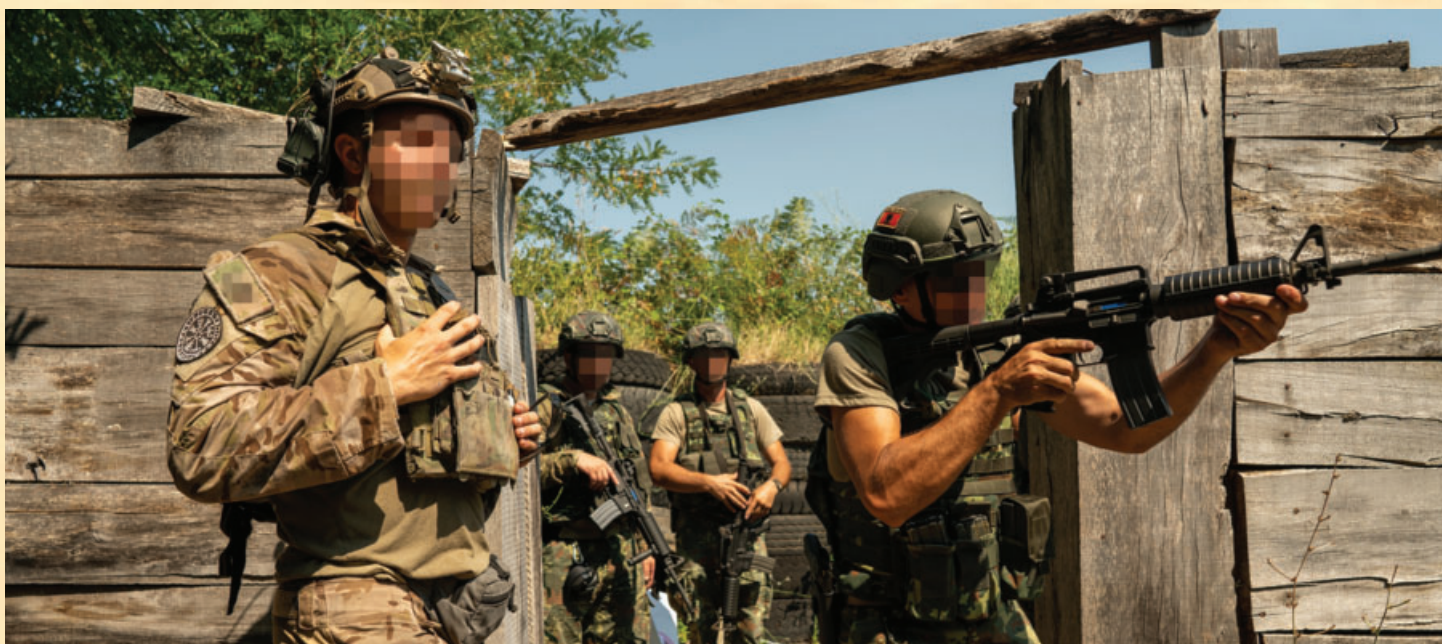
A U.S. Army Green Beret assigned to 10th Special Forces Group (Airborne) observes close-quarter-battle drills conducted by the Albanian Special Forces, Albania, July 21, 2021. Joint combined exchange training enhances interoperability with partner nations and strengthens military readiness, teamwork and joint confidence while promoting peace and stability in Europe.