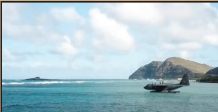
2021: AFSOC's year of innovation ... 20