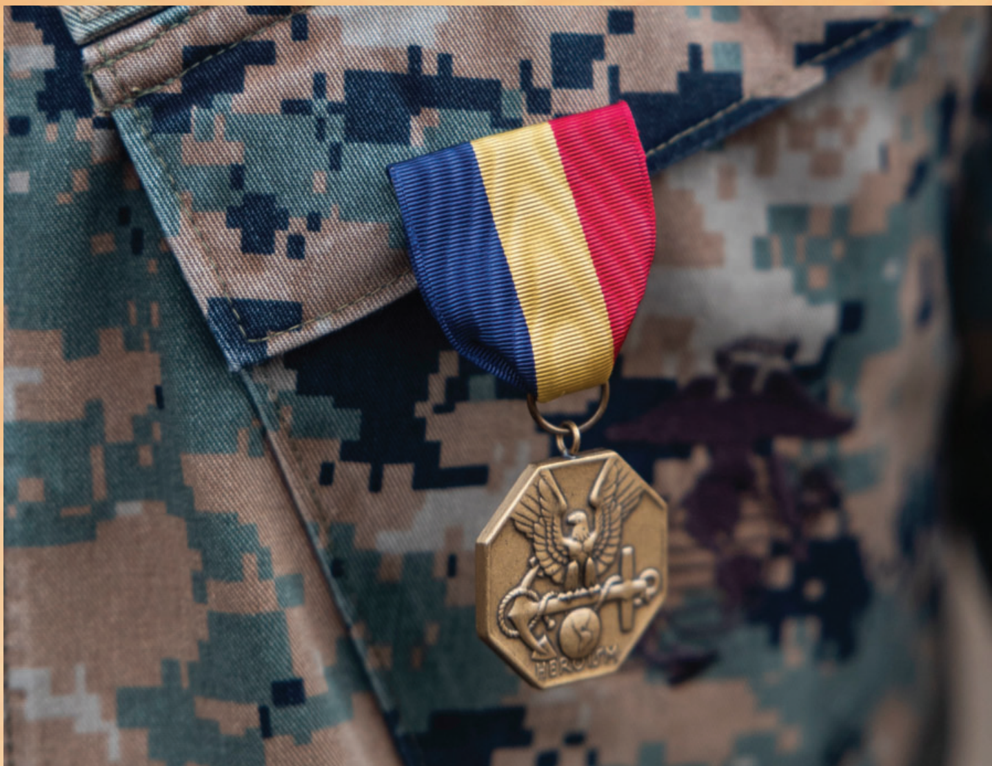
A Marine Raider is awarded the Navy and Marine Corps Medal during a ceremony at photo Camp Lejeune, Jan. 18, 2022.

the man was breathing and did not sustain any other injuries before sitting in the sand, completely overcome with exhaustion himself. The now reunited family thanked him for saving their lives. The adult male stated that he believed he and his son would have died in the water without his intervention. The Marine Raider knowingly placed himself in harm's way and risked his own life to rescue a family in distress.