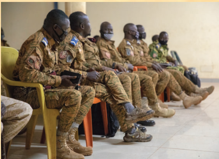
Burkinabe soldiers in Bobo-Dioulasso, Burkina Faso, receive a Civil-Military Operations class Feb. 19, 2021. CMO are activities of a military force to minimize civil interference on and maximize civil support for military operations. CMO is conducted in conjunction with combat operations to become a central part of a military campaign in counter-insurgencies

when engaging with partners. In any training we provide, one of the earliest lessons covered is the law of armed conflict, which helps protect human rights. During our annual exercise, Flintlock, we incorporate lessons on human rights, the law of war, due process, and civil engagement as part of our overall approach to countering extremism.