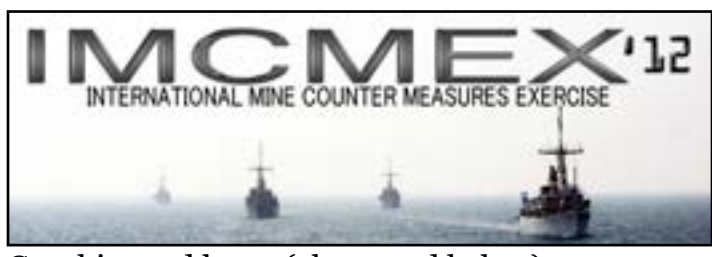
Graphics and logos (above and below)