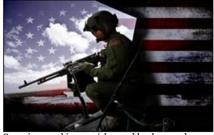
Superimposed images/changed backgrounds