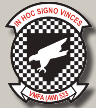
Marine All-Weather Fighter Attack

currently deployed aboard the USS Roosevelt.