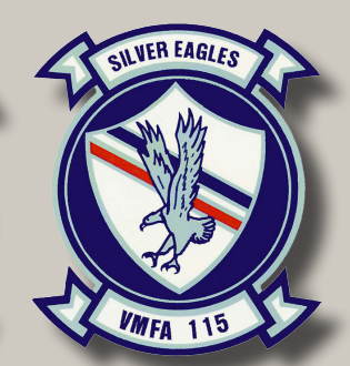
Marine Fighter Attack Squadron 115 is

Squadron 533 is currently deployed as part of the Unit Deployment Program.