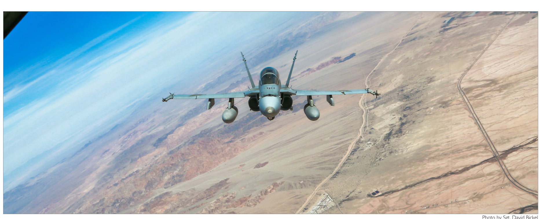
An F/A-18D Hornet prepares to conduct an aerial refuel during Weapons and Tactics Instructor Course in Yuma, Ariz. April 10. WTI is a seven-week training event hosted by Marine Aviation Weapons and Tactics Squadron 1, which emphasizes operational integration of the six functions of Marine Corps aviation in support of a Marine Air Ground Task Force. The Hornet is with Marine All-Weather Fighter Attack Squadron 224, Marine Aircraft Group 31 from MCAS Beaufort.