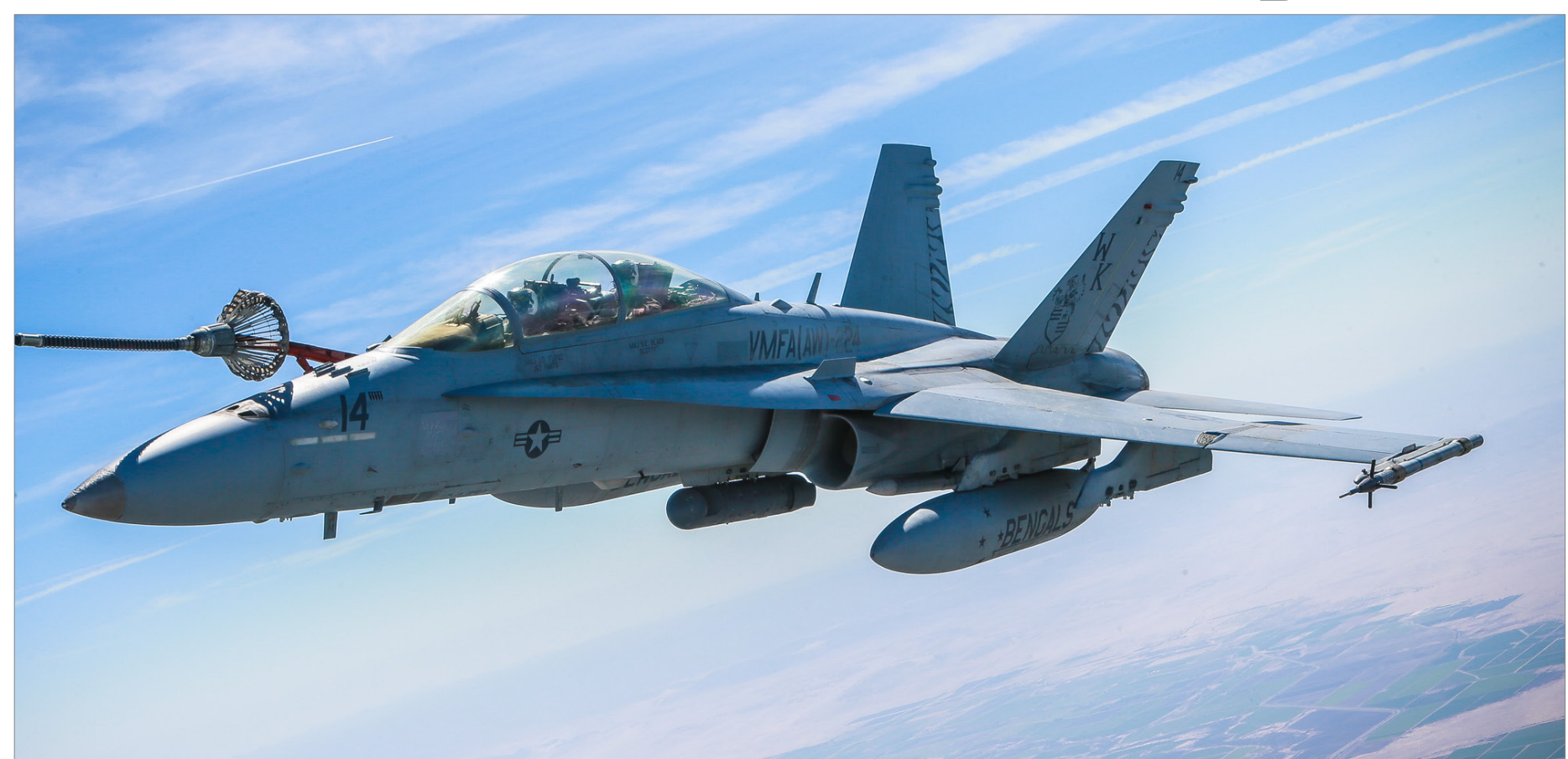
An F/A-18D conducts aerial refueling during Weapons and Tactics Instructor Course in Yuma, Ariz. April 10. WTI is a seven-week training event, hosted by Marine Aviation Weapons and Tactics Squadron 1, which emphasizes operational integration of the six functions of Marine Corps aviation in support of a Marine Air Ground Task Force. The Hornet is with Marine All-Weather Fighter Attack Squadron 224, Marine Aircraft Group 31 from MCAS Beaufort, S.C.