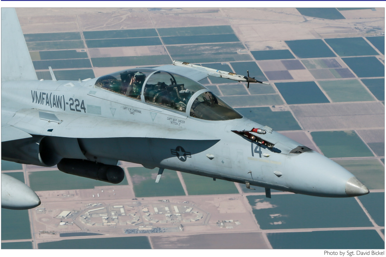
An F/A-18D Hornet conducts an aerial refuel utilizing a KC-130J during Weapons and Tactics Instructor Course in Yuma, Ariz. April 10. WTI is a seven-week training event hosted by Marine Aviation Weapons and Tactics Squadron 1, which emphasizes operational integration of the six functions of Marine Corps aviation in support of a Marine Air Ground Task Force. The Hornet is with Marine All-Weather Fighter Attack Squadron 224, Marine Aircraft Group 31 from MCAS Beaufort, S.C.

The Jet Stream | Friday, April 20, 2018 In Other News