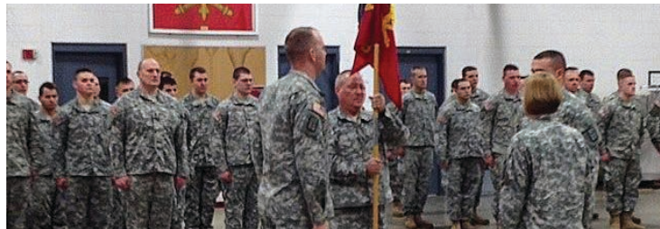
B Battery, 2nd Battalion, 174th Air Defense Artillery, Ohio Army National Guard is the recipient of the 2017 Alexander Hamilton Award.

The Hamilton Award recognizes the outstanding Army National Guard Air and Missile Defense Battery of the Year for superb mission accomplishment and overall unit excellence. The 2017 Hamilton award goes to B Battery ( Vulcan ), 2nd Battalion, 174th Air Defense Artillery Regiment, Ohio Army National Guard. B Battery also won this award in 2012.