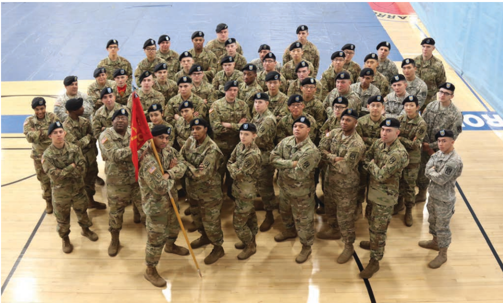
Headquarters Battery, 2nd Battalion, 1st Air Defense Artillery Regiment received the 2017 Henry Knox Award.

The Henry A. Knox Award recognizes the outstanding active-duty Army Air and Missile Defense Battery of the Year for superior mission accomplishment and overall unit excellence within the air defense community.