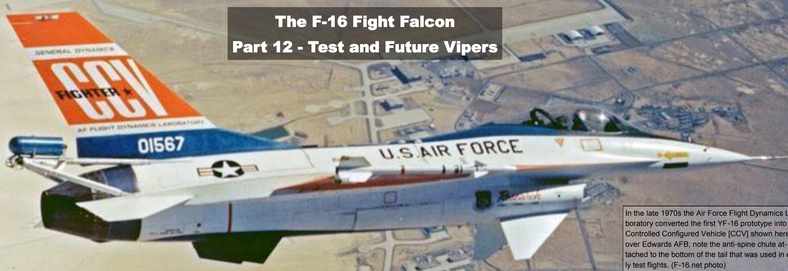
In the late 1970s the Air Force Flight Dynamics Laboratory converted the first YF-16 prototype into the Controlled Configured Vehicle [CCV] shown here over Edwards AFB; note the anti-spine chute attached to the bottom of the tail that was used in early test flights.