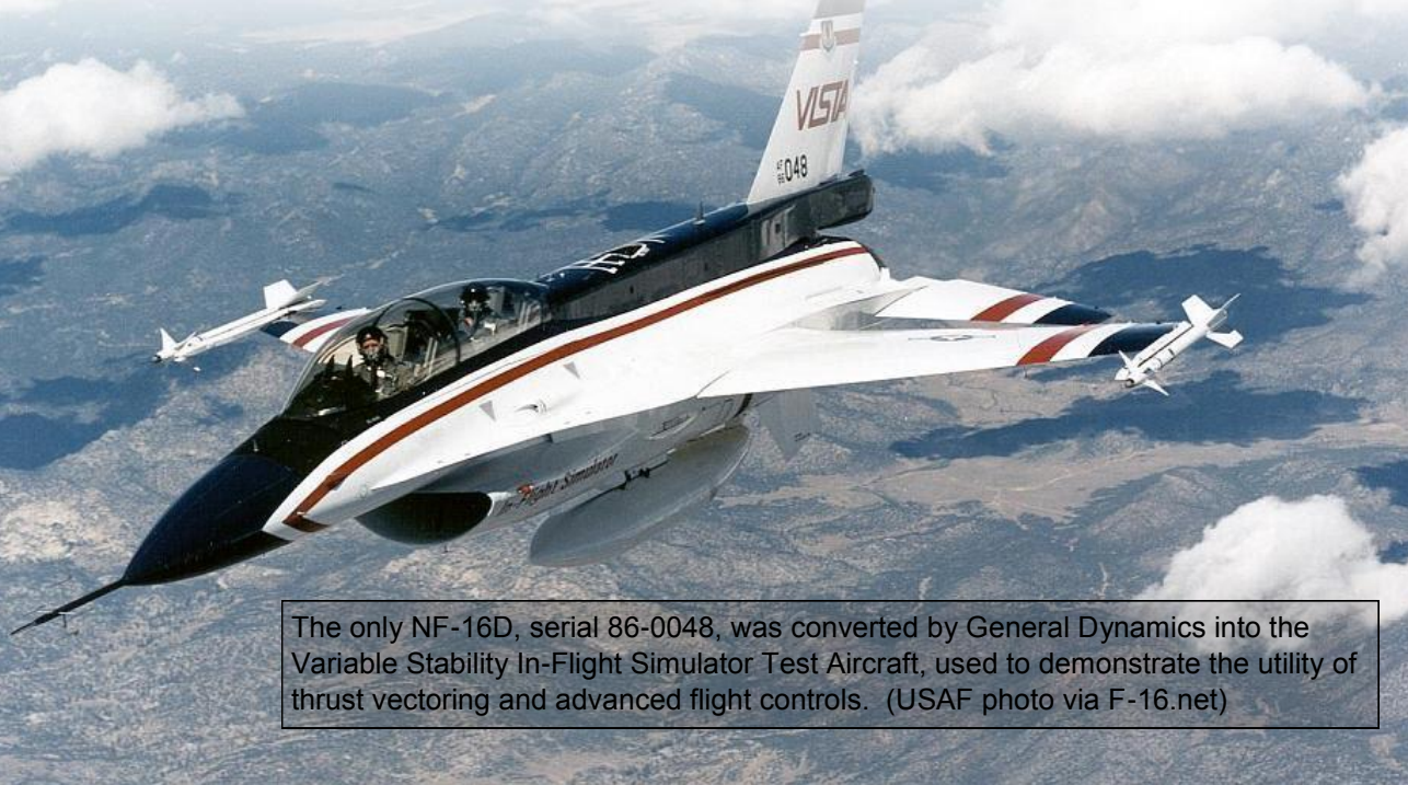
The only NF-16D, serial 86-0048, was converted by General Dynamics into the Variable Stability In-Flight Simulator Test Aircraft, used to demonstrate the utility of thrust vectoring and advanced flight controls.

The goal is to eliminate the bulky, heavier and more complex ramps and doors used by current fighters. In doing so, the radar cross-section is drastically reduced. Diverterless inlet technology utilizes a bump on the inboard side of a jet intake along with a forward swept outer intake fairing to separate boundary layer air and to slow down airflow reaching the jet’s engine face during supersonic maneuvers. Without moving parts, it allows for the deletion of heavy and complicated intake diverters, intake ramps and cones.