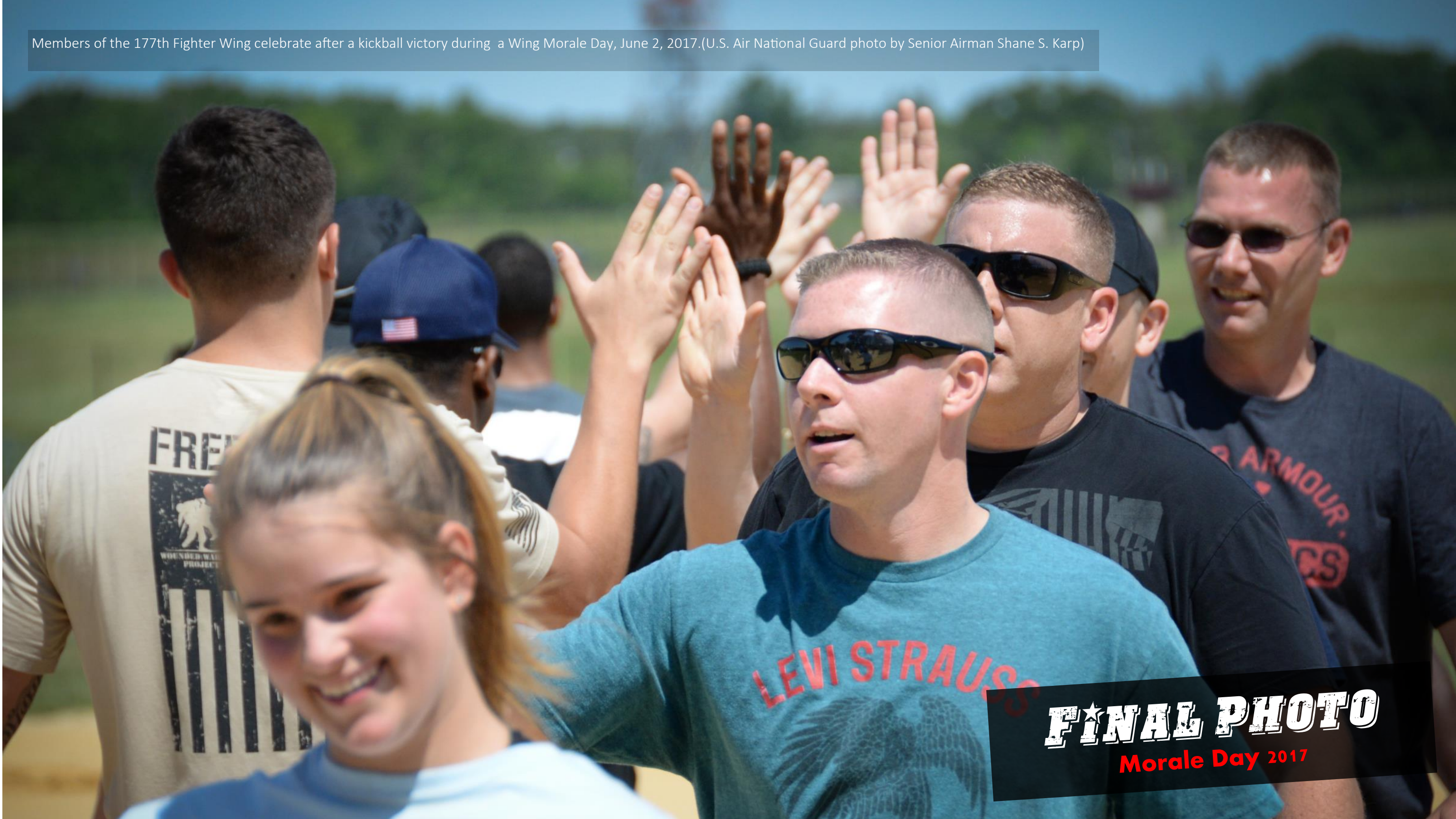
Members of the 177th Fighter Wing celebrate after a kickball victory during a Wing Morale Day, June 2, 2017.