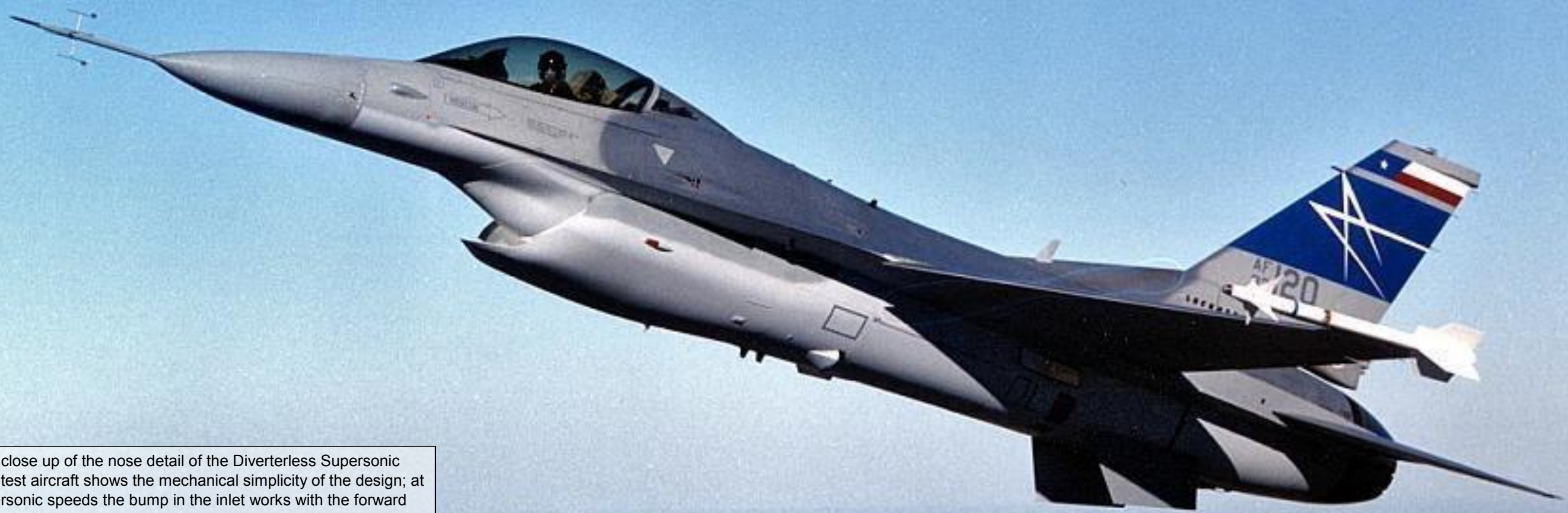
This close up of the nose detail of the Diverterless Supersonic Inlet test aircraft shows the mechanical simplicity of the design; at supersonic speeds the bump in the inlet works with the forward swept inlet cowl to redirect unwanted boundary layer airflow away from the air inlet. .

eration fighter in the world.” Lockheed Martin contends that in the F-16V configuration, combat capabilities relevant in the current complex aerial battlefield are affordable and available today. The F-16V incorporates many advancements over earlier production variants, with the most important being the Active Electronically Scanned Array [AESA] radar; it also relies on modern, commercial “off-the-shelf” avionics with large format, high-resolution displays; and a high volume, high-speed data bus. In terms of combat capabilities, it incorporates a Link-16 Theater Data Link; the Sniper Advanced Targeting Pod; Precision GPS; Automatic Ground Collision Avoidance System; and the ability to carry all of the current and emerging advanced weapons. The most significant external differences are the bulged spine and conformal fuel tanks.