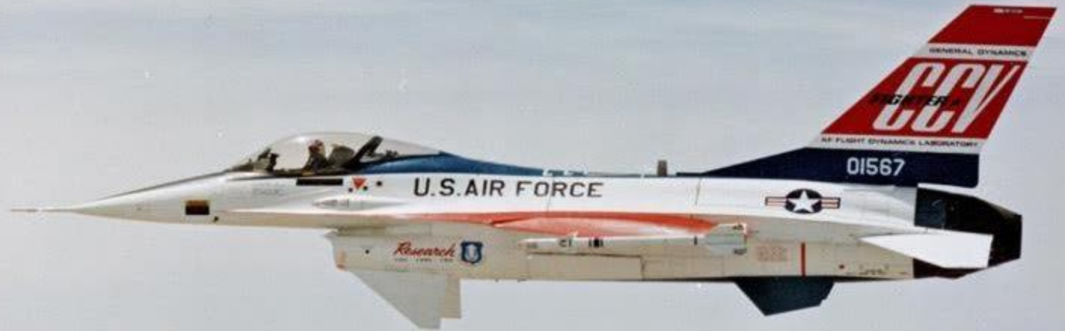
The Controlled Configured Vehicle [CCV] YF-16, serial 72-1567, was used to test enhanced maneuverability with uncoupled flight controls; it is shown over Edwards AFB.

The AFTI demonstrator first flew on 10 July 1982 at Ft. Worth and was then transferred to Edwards AFB for a two-year program that encompassed 275 flights. The DFCS proved the ability to give a pilot a new, unprecedented freedom in maneuvering, making it possible to assume and maintain unconventional and unorthodox flight attitudes using nosing pointing, direct force translation and other novel maneuvers. During the course of the testing other technologies such as novel heads-up displays, synthesized speech warnings, touch sensitive screens and pictorial formats for situational displays of the aircraft’s orientation in all axes were tried. In Sep-