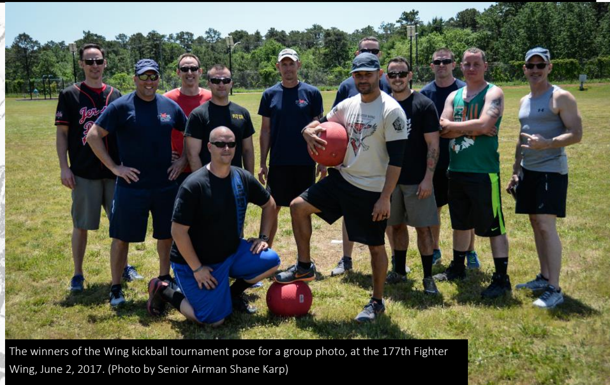
The winners of the Wing kickball tournament pose for a group photo, at the 177th Fighter Wing, June 2, 2017.