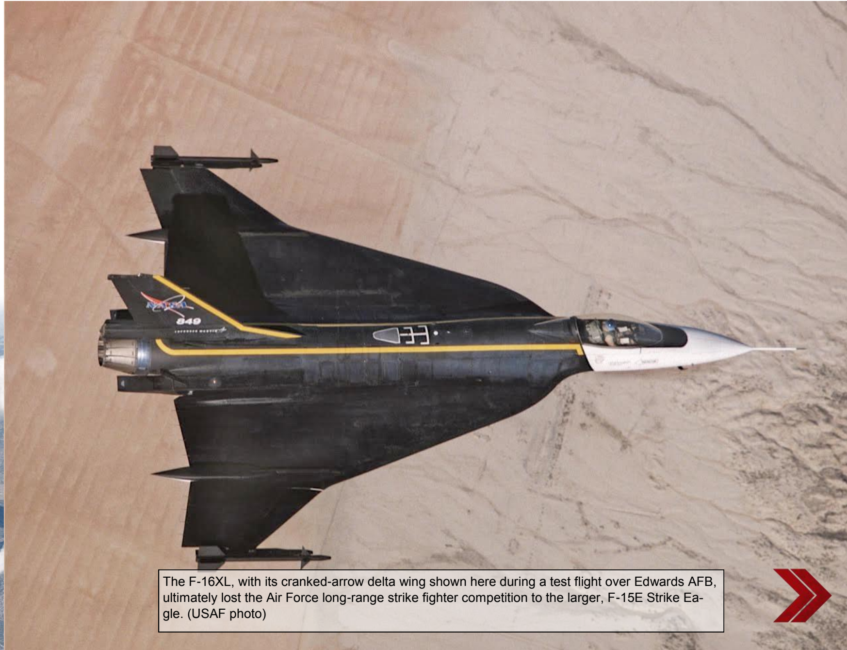
The F-16XL, with its cranked-arrow delta wing shown here during a test flight over Edwards AFB, ultimately lost the Air Force long-range strike fighter competition to the larger, F-15E Strike Eagle.