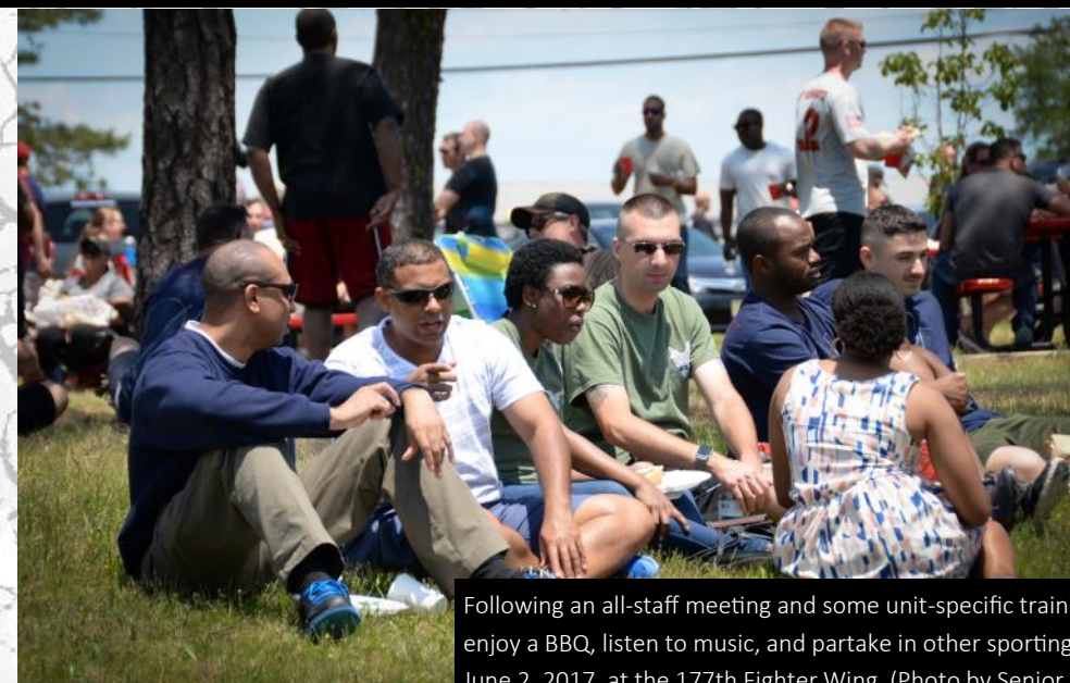
Following an all-staff meeting and some unit-specific training, members were released to enjoy a BBQ, listen to music, and partake in other sporting activities as part of a morale day, June 2, 2017, at the 177th Fighter Wing.