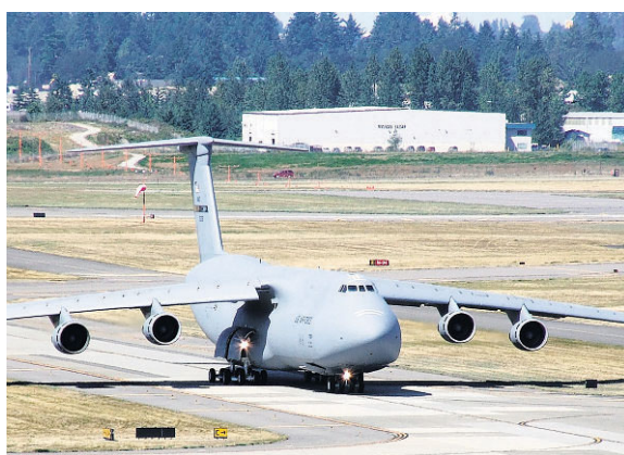
TECH. SGT. SCOTT T. STURKOL U.S. Air Force photo / 2007

Mass awareness of the issue began before the last round of