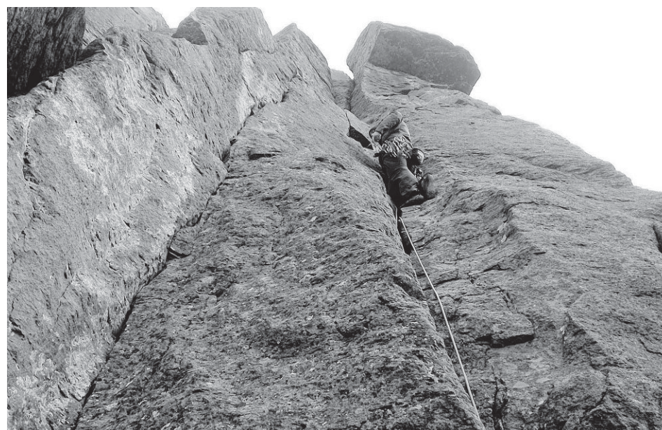
JBLM Outdoor Recreation

For more information, email jblmalpineclub@gmail.com . $5,000.