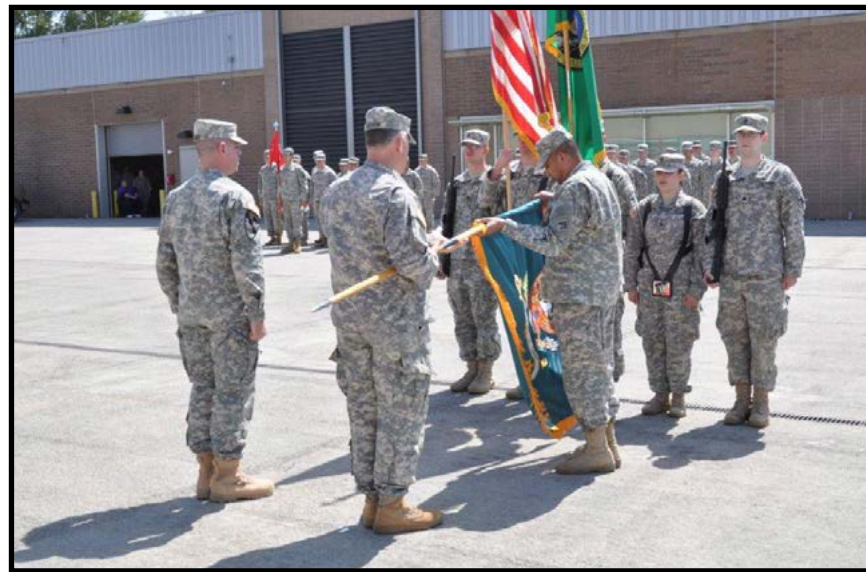
The colors are cased as the 81st Brigade Special Troops Battalion is re-flagged as the 898th Brigade Engineer Battalion.

The Washington National Guard said goodbye to the 81st Brigade Special Troops Battalion and welcomed back the 898th Brigade Engineer Battalion during a reflagging ceremony at the Marysville Armed Forces Reserve Center. The Engineer Battalion returns after deflagging in 2005 and now includes multiple Engineer Companies, a Signal Company, a Military Intelligence Company, a Forward Support Element and a Headquarters Company.