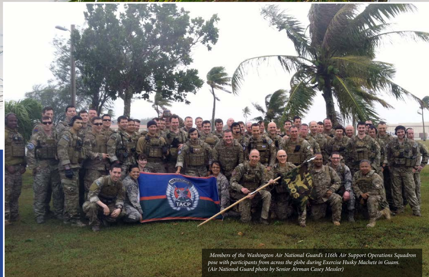
Members of the Washington Air National Guard’s 116th Air Support Operations Squadron pose with participants from across the globe during Exercise Husky Machete in Guam.

Ultimately, they also achieved another critical goal: train their team to successfully adapt and overcome any obstacle that may be presented, whether on a foreign battlefield or in support of their neighbors here in Washington.