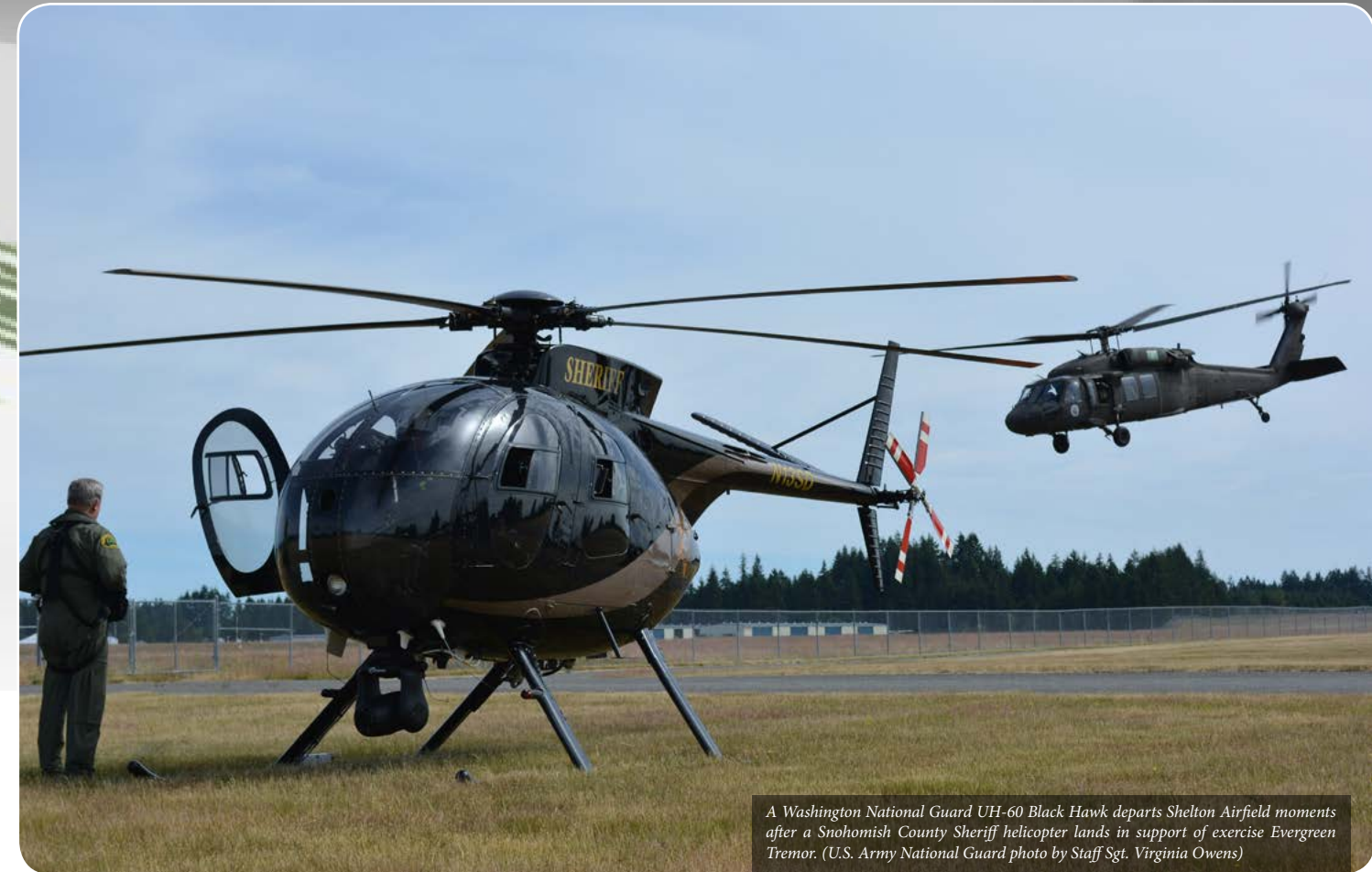
A Washington National Guard UH-60 Black Hawk departs Shelton Airfield moments after a Snohomish County Sheriff helicopter lands in support of exercise Evergreen Tremor.

The exercise also tested some broader interoperability concepts: communications systems, distribution of supplies and effectiveness of command and control points on various sized bases throughout the state.