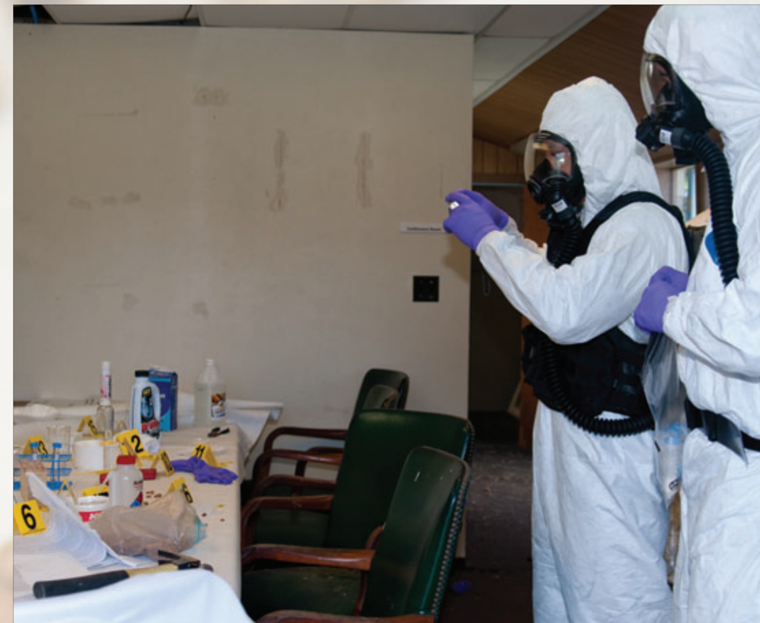
FBI agents in hazmat suits take photos of a simulated hazardous crime scene at the Dec. 3 Patriot Palm exercise at Kaneohe Bay. Agents were challenged to find evidence while in their hazmat suits.