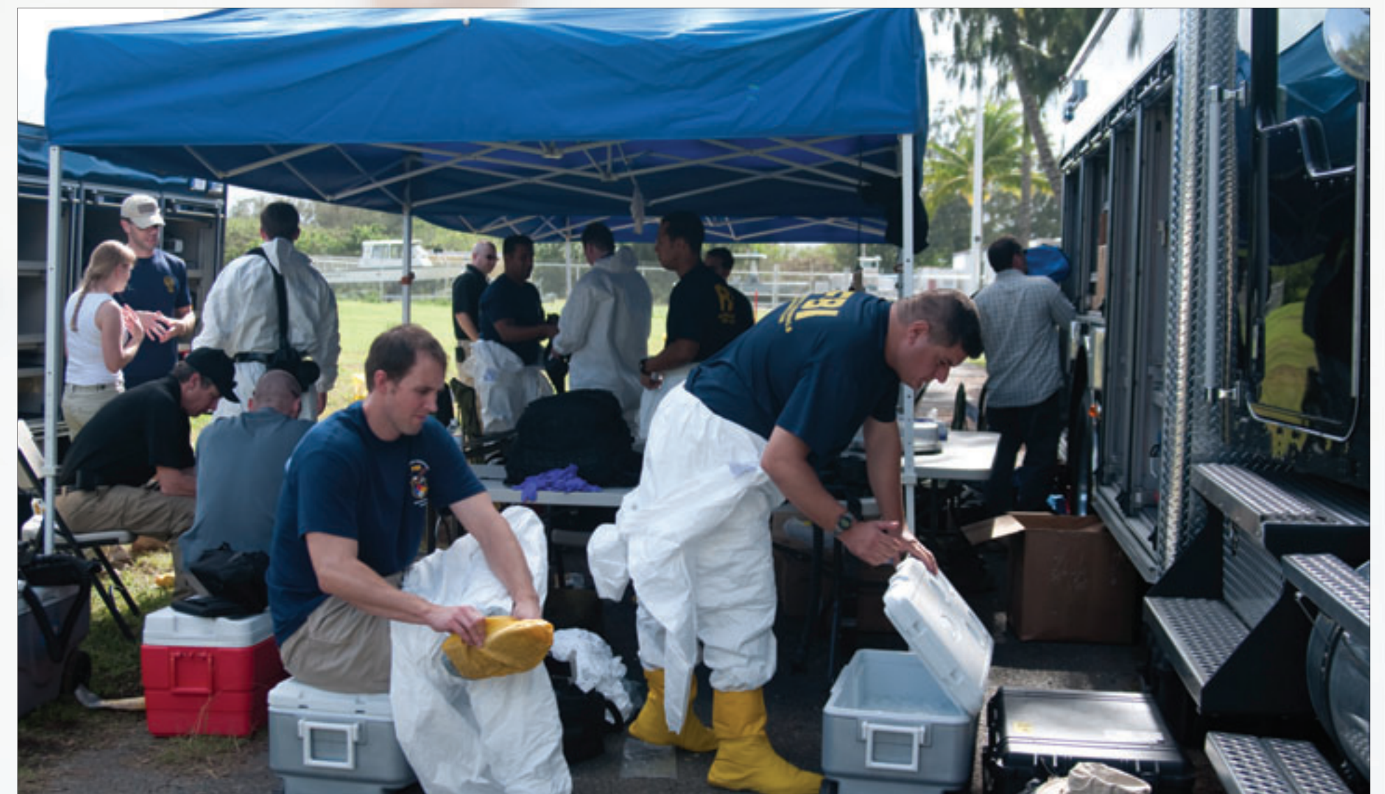
FBI agents in hazmat suits investigate and collect evidence in a simulated hazardous materials crime scene. Agents wrapped masking tape around their wrists, ankles and in the front of their suits to ensure their safety. During last year's exercise, agents were sent underwater to recover evidence.