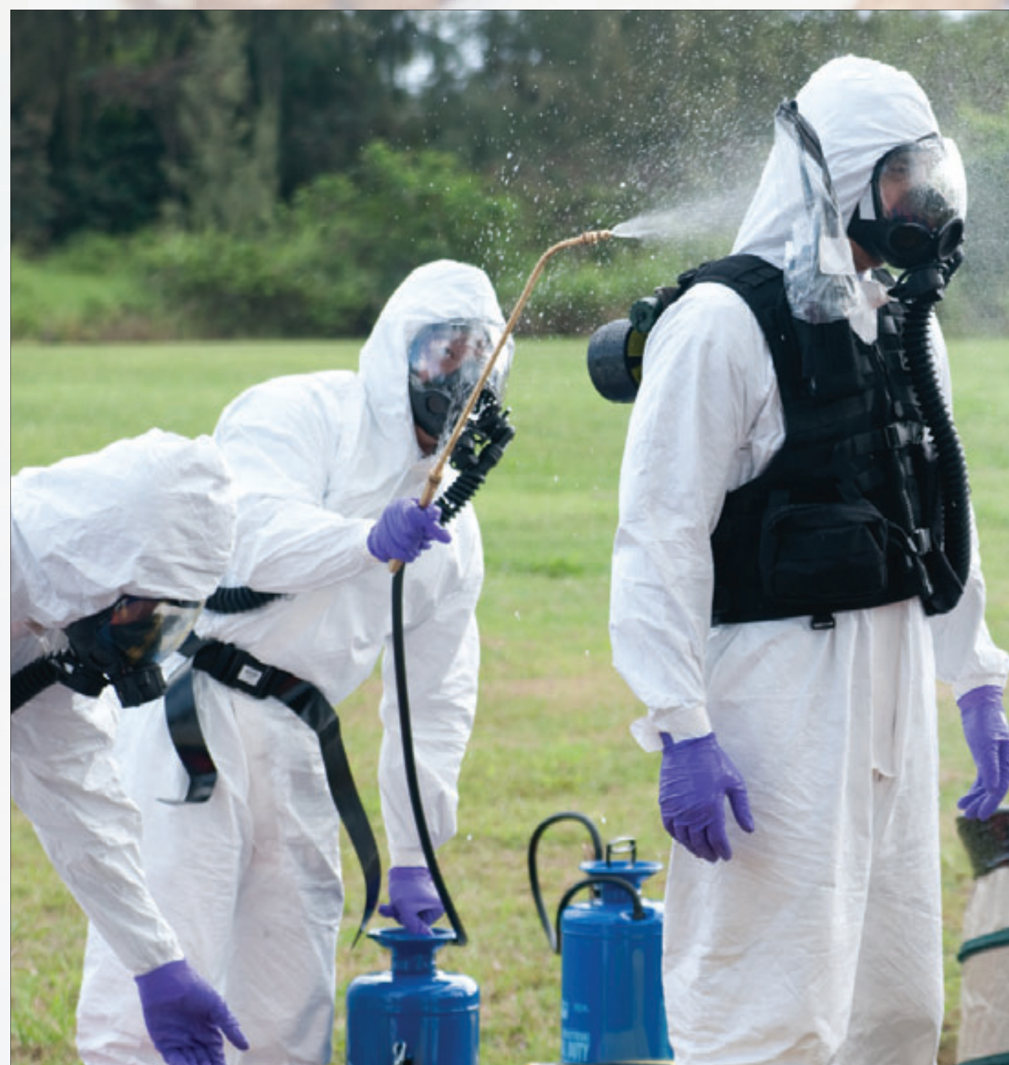
Wearing hazmat suits, FBI agents go through the first stage of decontamination during the Patriot Palm exercise Dec. 3 at Marine Corps Base Hawaii. The exercise tested the Los Angeles Division's rapid response team, who deploys to domestic and foreign crime scenes within 24 hours.