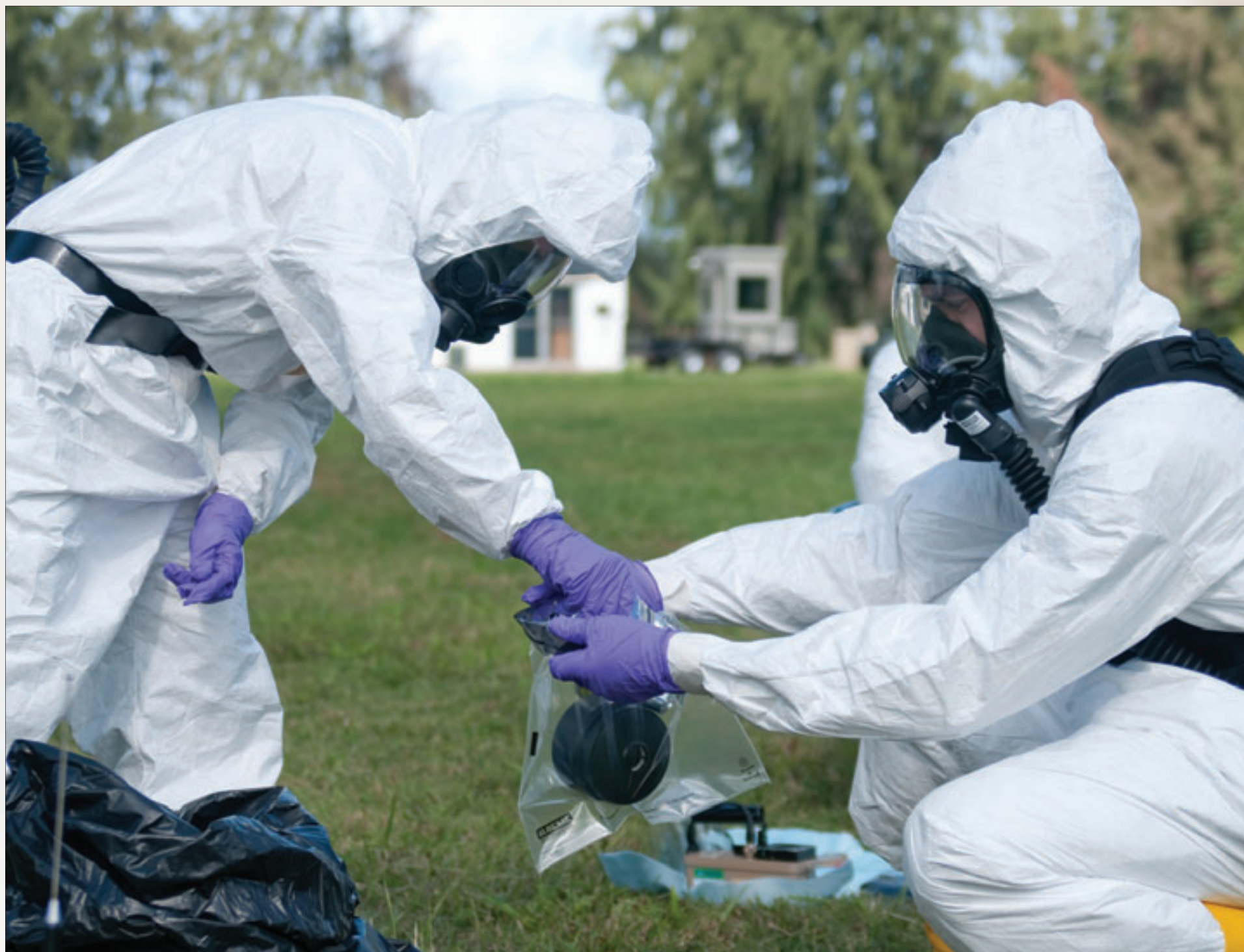
Simulating a hazardous crime scene, FBI agents collect key evidence at Kaneohe Bay Dec. 3 during the annual Patriot Palm exercise. More than 40 FBI agents flew from the bureau's Los Angeles Division to Oahu to practice conducting an investigation in an unstable environment.