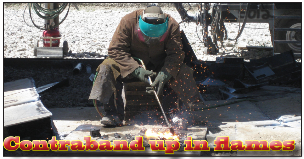
A Defense Reutilization and Marketing Office employee utilizes a torch to destroy contraband seized by Soldiers assigned to the 415th Military Police Company, 10th Special Troops Battalion, 10th Sustainment Brigade. The 415th MP CO's mission while deployed to Bagram Air Field, Afghanistan is focused on customs operations.