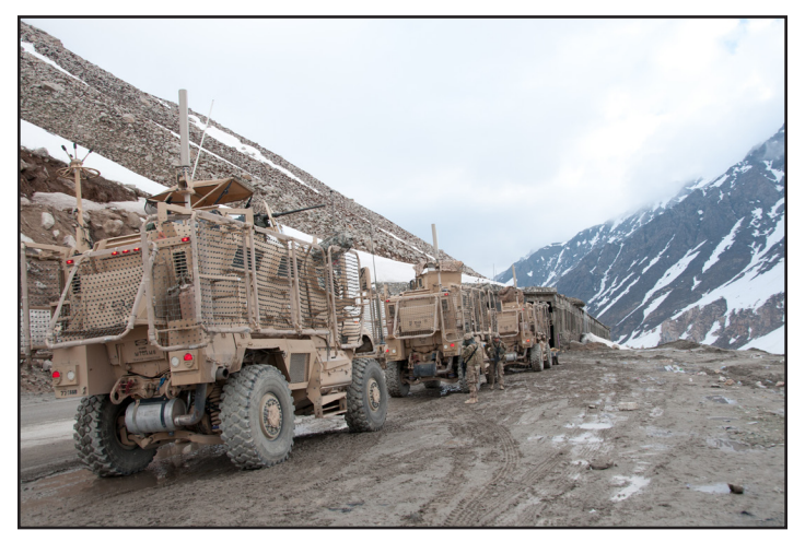
Soldiers assigned to the 114th Transportation Company and 730th Transportation Company halt their convoy escort team momentarily to refuel their vehicles, which included Mine Resistant Ambush Protected trucks. Stops were kept to a minimum and only done when absolutely necessary to ensure the mission was accomplished successfully.

Soldiers went to get some rest. They know they have many missions ahead. Logisticians will continue to travel across Afghanistan to ensure sustainment operations are successful as well as the transition of equipment in order to assist the Army with meeting its goals in support of Operation Enduring Freedom.