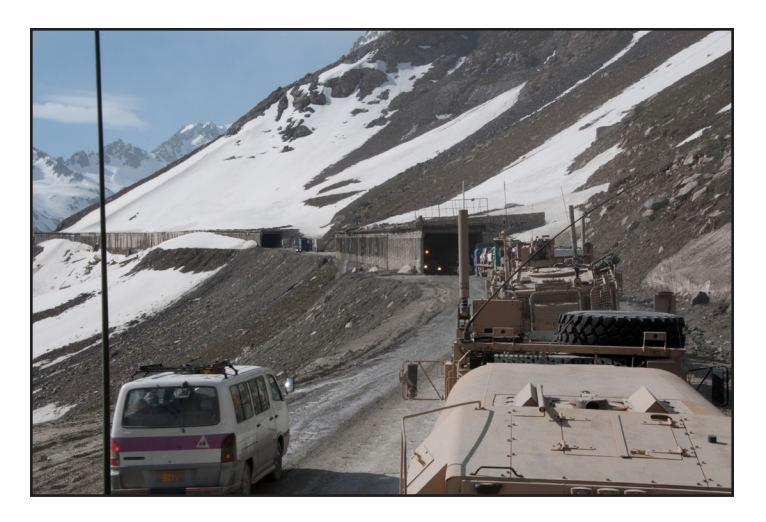
Vehicles from the 114th Transportation Company and 730th Transportation Company convoy escort team prepare to enter several tunnels located at the Salang Pass in Afghanistan during a mission in support of Operation Enduring Freedom. The CET provides security for National Afghan Trucking vehicles to ensure the loads arrive to their destination safely.