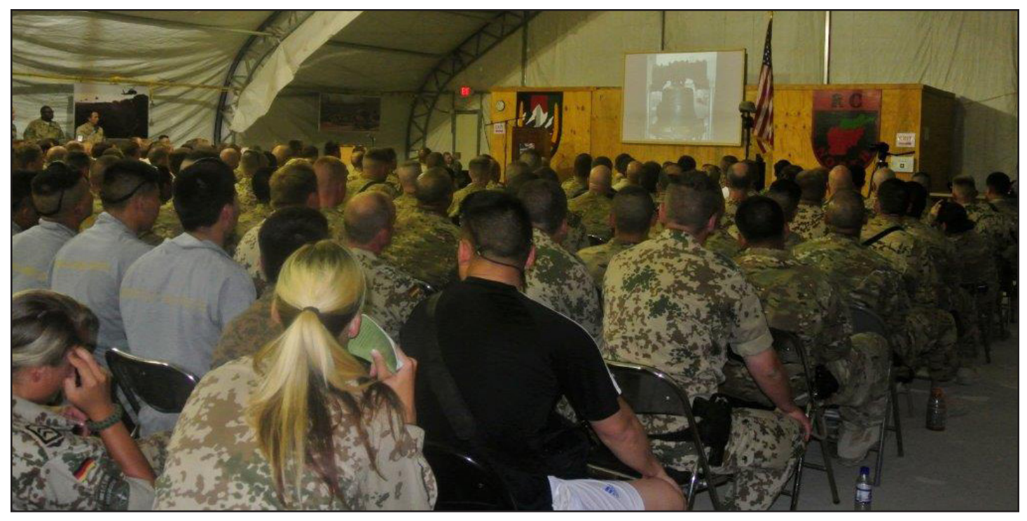
Multi-national Soldiers, civilians, and contractors attend a Memorial Day ceremony held at Camp Marmal, Afghanistan May 26.