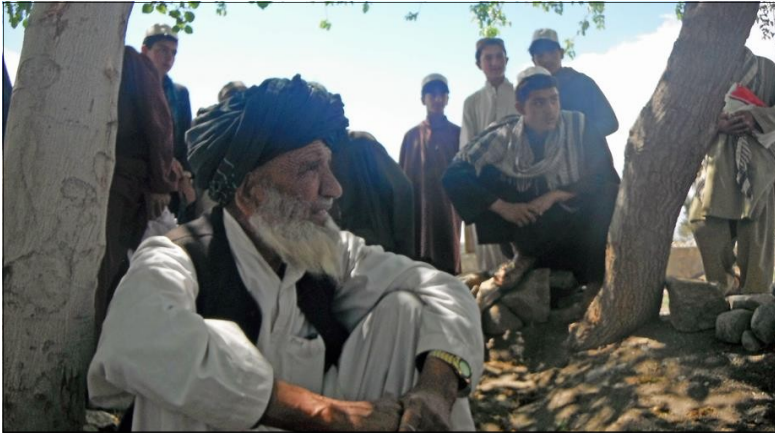
A local farmer discusses agricultural issues with PRT Khost leadership during a recent visit to a village near Forward Operating Base Salerno in Afghanistan.