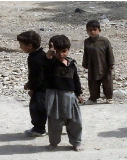
A local Afghan boy gives a “thumbs up” to passing PRT Khost vehicles on patrol in Khost Province, Afghanistan.