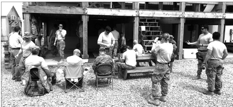
Elements of the Khost Provincial Reconstruction Team watch the numerous matches during the first PRT Khost Dart Tournament at FOB Salerno.