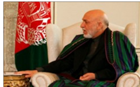
- Remarks to the Nation by His Excellency Hamid Karzai, President of the Islamic Republic of Afghanistan on the occasion of the New Afghan Year, 1390

From here, I would like to call on the Taliban that there is a place for those who are willing to live in peace and brotherhood and within Islamic justice and law. Foreigners are here, because other foreigners attacked them and attack them now. Return to a peaceful life and share in politics through legitimate means is the only way that can enable Afghanistan end its dependence on others.