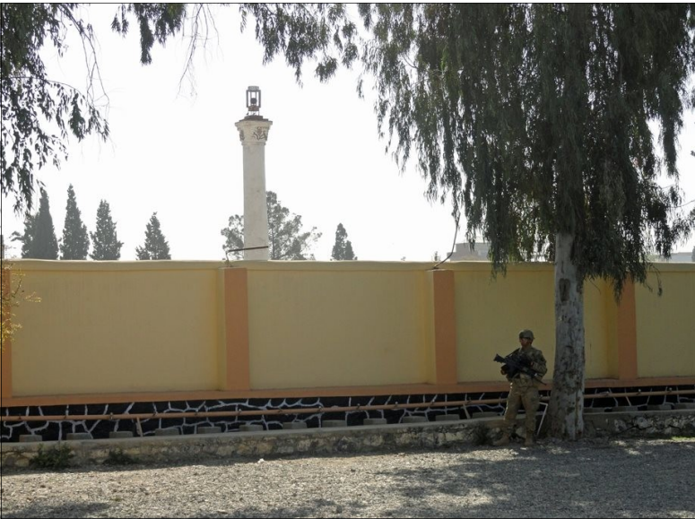
A PRT Khost—Security Force member patrols within the Civil Military Operation Center (CMOC) compound during a recent key leader engagement in Khost City.